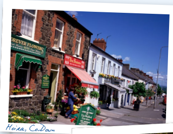
Moira, Co. Down

In Enniskillen town, check out new artisan deli, Between the Bridges , as well as Joe The Baker's superb sourdough and O'Doherty's famous Fermanagh black bacon, made from 'happy' pigs who roam freely on Inishcorkish Island on Upper Lough Erne . Have a pint in characterful Blakes of the Hollow , one of