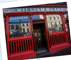
Blakes of the Hollow