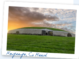
Newgrange, Co. Meath

On your way back to Dublin , both the famous neolithic Newgrange World Heritage site in the heart of the Boyne Valley and the 18th century Tankardstown House and Gardens , are well worth a detour. There you will find 80 acres of formal gardens, woodland and parkland to explore, and you can also enjoy a casual lunch in the Brabazon restaurant before heading to the port for the trip home.