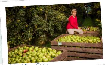
Armagh Apple Cider