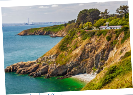
Dublin Bay from Howth Head

Once you've arrived in Ireland (not that I might be biased, coming as I do from Co. Antrim!), why not head north instead of south or west as you drive off the ship, and discover some of the country's hidden foodie gems?